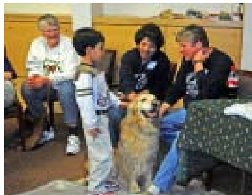
Cornell Vet School Open House