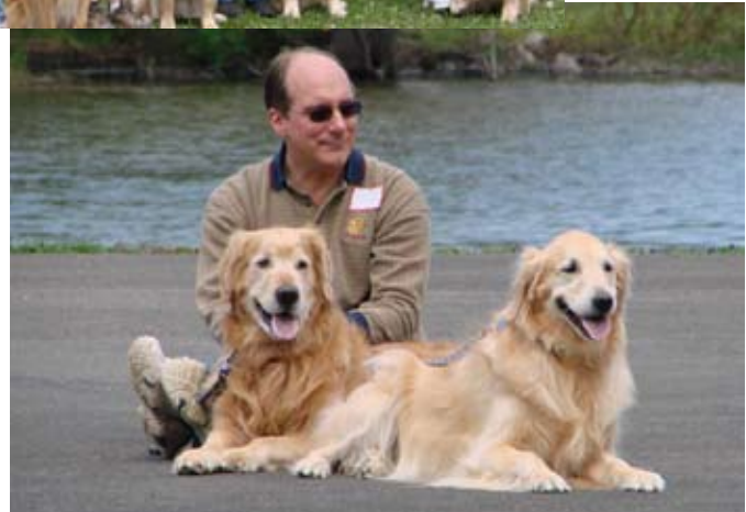
Golden Reunion 2007