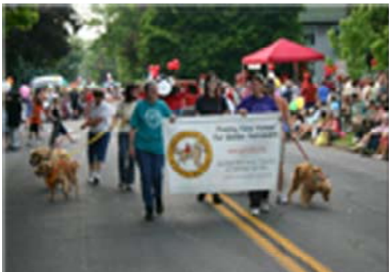
Ithaca Festival Parade