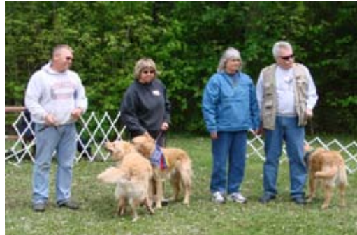
New Life Time Members