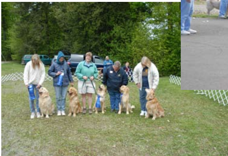
New Canine Good Citizens