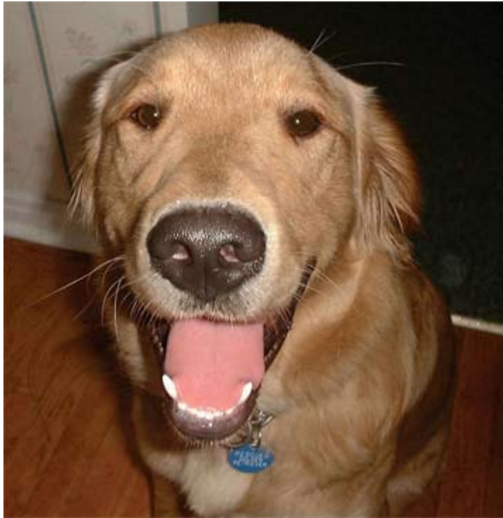
Petey, one lucky dog.....

This issue's foster home spotlight features Petey and a foster dog's view on what it is liked to be fostered. Ever wonder how fun it could be to foster a golden? Read about Petey's first days at his foster home on the GRRCNY website.