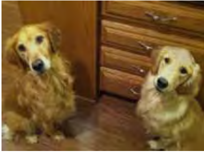
Together they romp and play and seek And sometime they work to earn a treat.