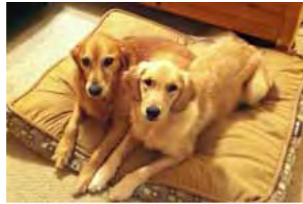
Every night they snuggle in deep To a comfy bed upon which to sleep.