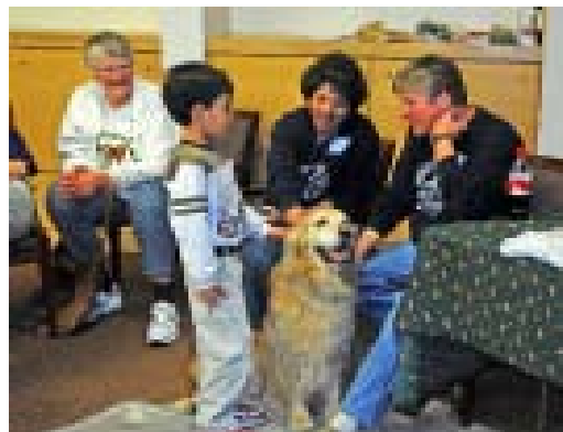
Cornell Vet School Open House