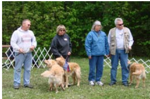
New Life Time Members