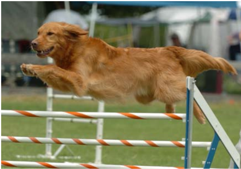
Brinker shows his style