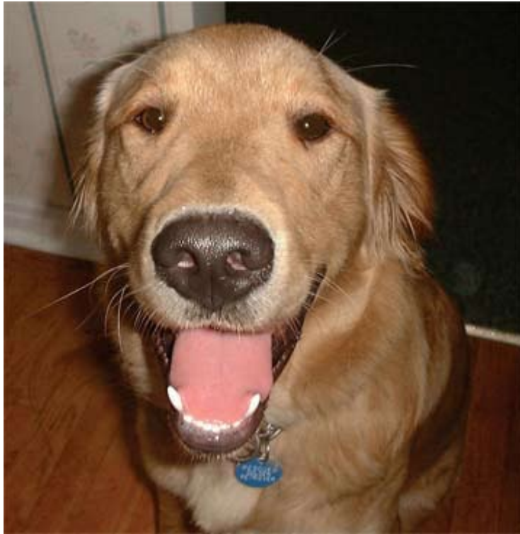
Petey, one lucky dog.....

This issue's foster home spotlight features Petey and a foster dog's view on what it is liked to be fostered. Ever wonder how fun it could be to foster a golden? Read about Petey's first days at his foster home on the GRRCNY website.